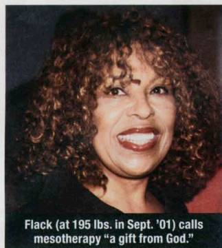
Flack (at 195 lbs. in Sept. '01) calls mesotherapy "a gift from God."